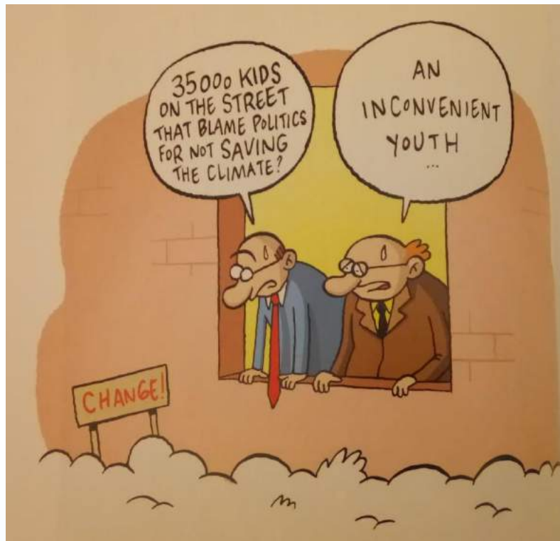
The Brussels Times Magazine No 33